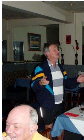
Which holy man is this blessing the gathering?