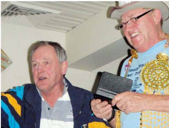
Projecting his story!