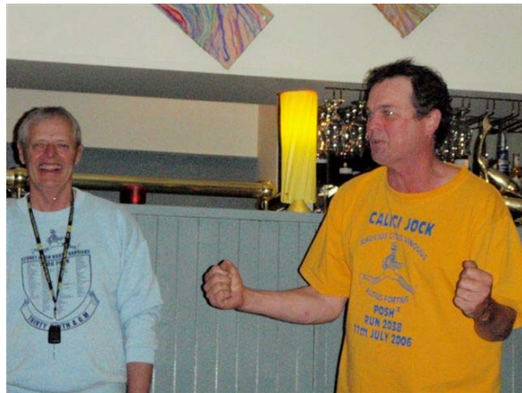
And he grabbed her like this