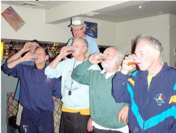
A well earned beer