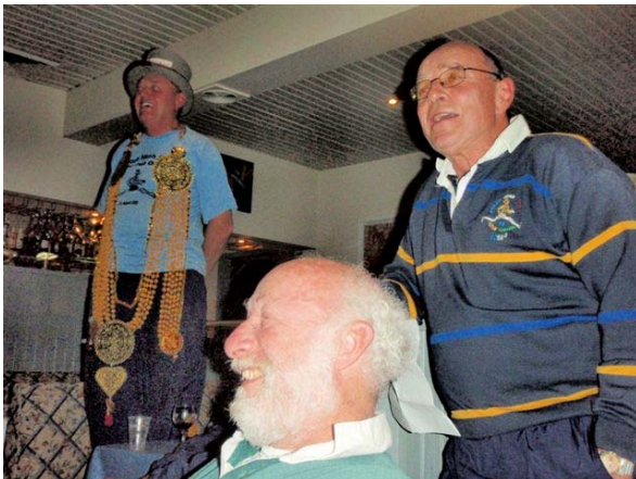
A Pee Dub impersonator about to read to us