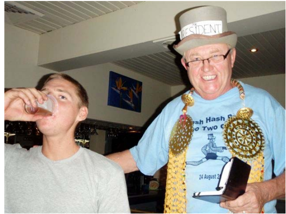
Polished off right smart