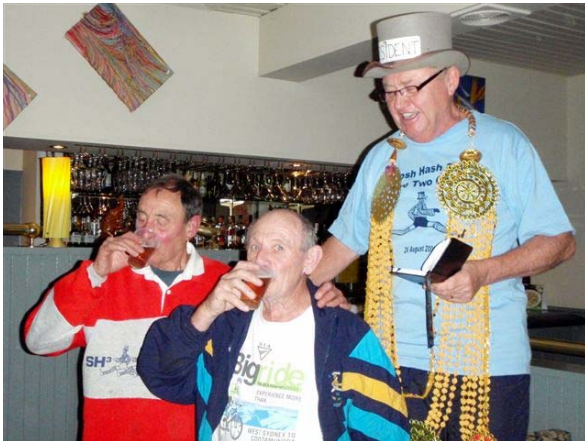
Another great run, thanks Hares

http://www.sh3.org.au/OldRunReports/OldRunReports.html