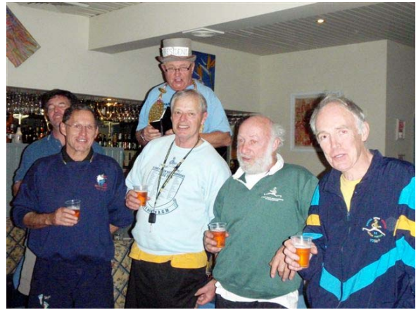
The OxFam good cheer squad