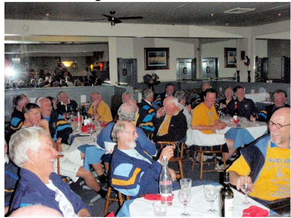
Why did all the women leave?