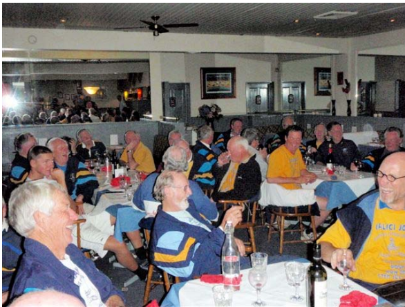
When all these handsome men are available