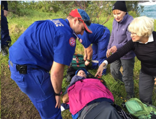
White Rabbit said to the paramedic " look, I said Patella, not Penis or was the other way around !!"