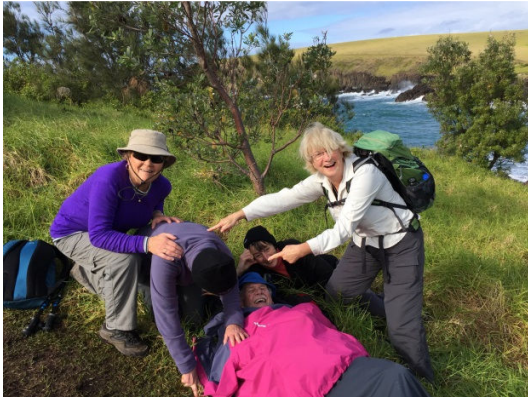
Tyre Fruck in excruciating pain