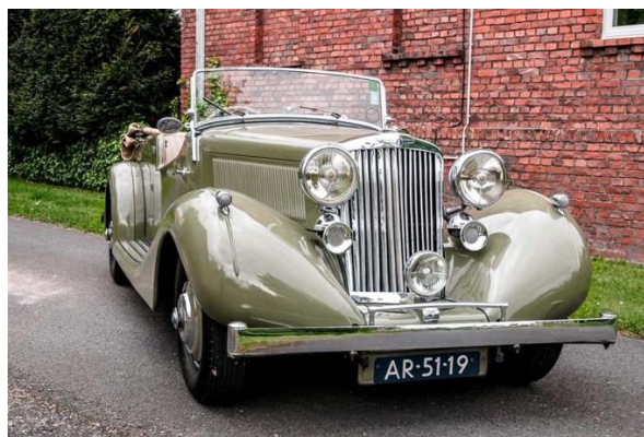
1938 Talbot 3 Litre Tourer

The green 1938 Tourer is currently on sale in Germany for €179,000 Euros ($290,000 AUD)!