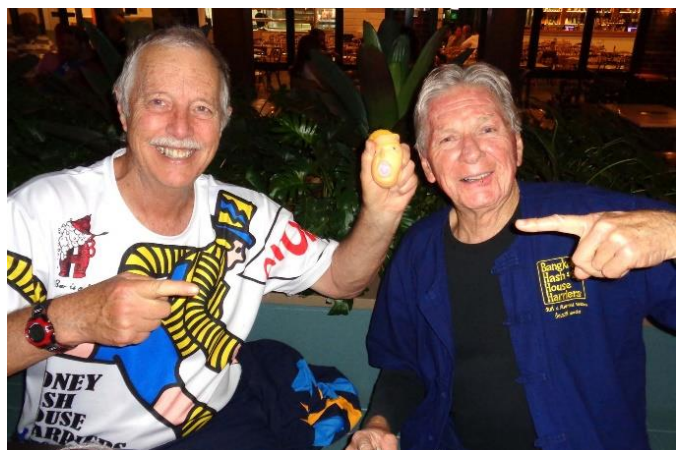
Just hold it in the palm of your hand and squeeze!

Smiley brought along a squeeze ball tonight. They are claimed to help with blood circulation as well as easing stress and tension. The unusual thing about this ball was that it had been formed in the shape of Donald Trump's head. Tic Toc was keen to try it out.