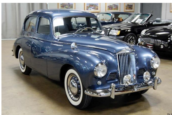
1953 Talbot Mk 2